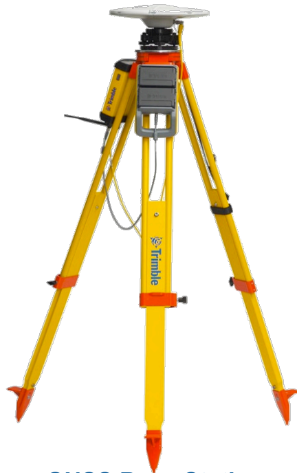
GNSS Base Station