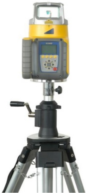
GL600 Grade Laser