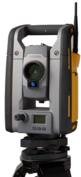
Universal Total Station